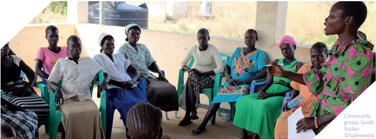
Community group, South Sudan

Women's participation in peacebuilding and security is crucial, and not just because they make up half of the population of fragile and conflict-affected communities. Women are often more affected by conflict and suffer particular forms of violence on the basis of their sex and gender, fuelled by harmful gender norms and gender inequality. Because of their specific needs and experiences, determined mainly by these gender norms, they have a different understanding of safety and security issues affecting the communities in which they live and a different perspective of the conflicts that occur within their communities. Women's voices must be heard in order for effective solutions to be found, and for peace to be both inclusive and sustainable.