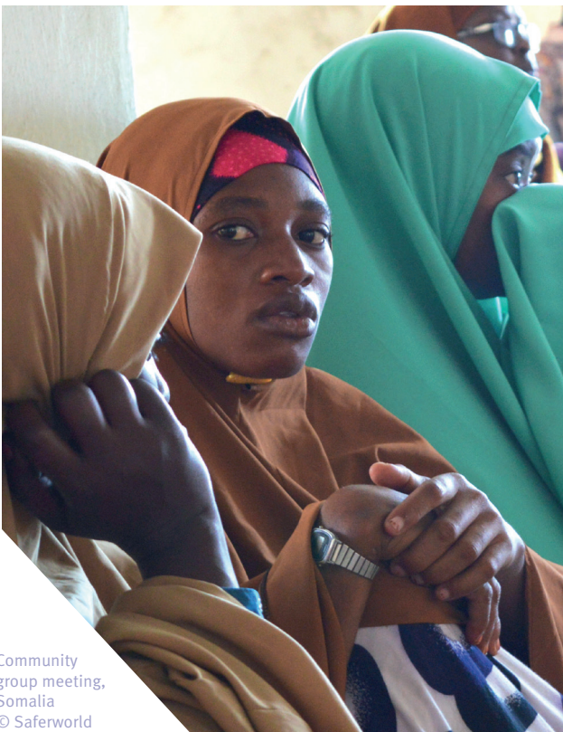
Community group meeting, Somalia