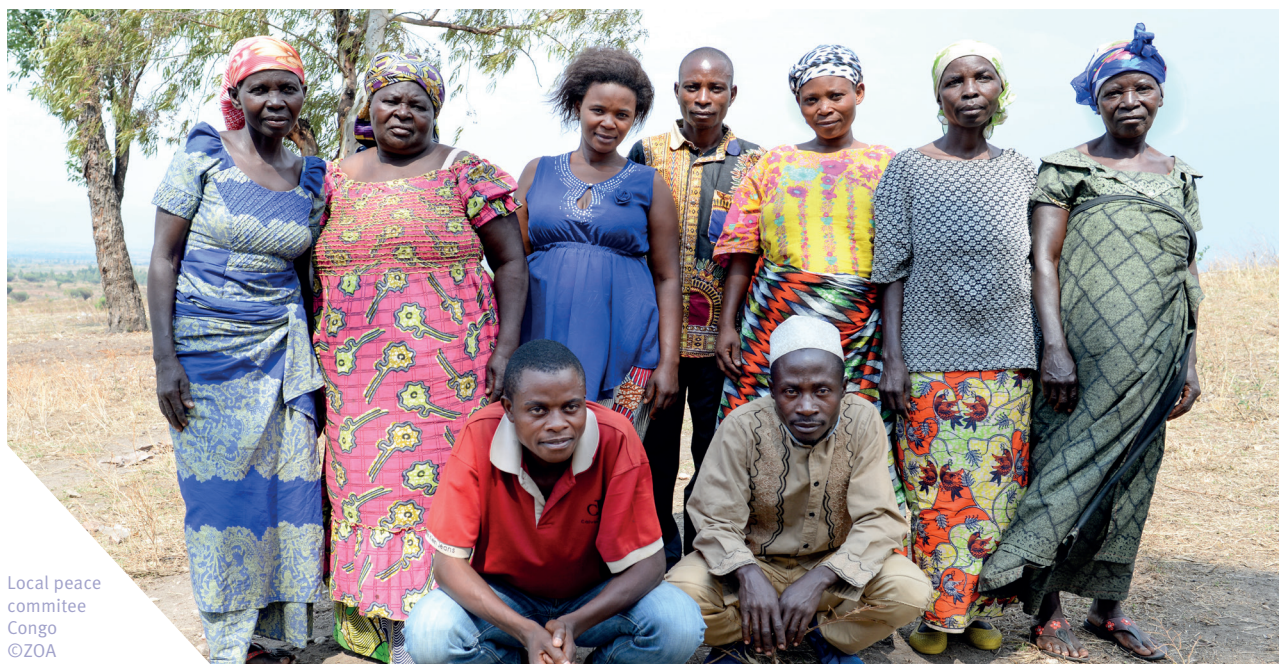
Local peace committee Congo

In South Sudan, CARE, who also took part in the learning event, uses community score cards 5 to monitor gender justice policies and advocate for their implementation by customary law actors and law enforcement institutions; this helps bring policy implementation gaps to the attention of local government authorities. The community score card is a participatory process that engages service users (both men and women), service providers and authorities (duty bearers) in assessing the quality and effectiveness of public services; this culminates in a joint action plan for improving that service, which is monitored by the community. Cycles of the model are repeated to detect changes in the quality of the basic service delivery. The process enhances awareness of rights, strengthens women's agency and input, fosters dialogue, facilitates a common understanding of potential solutions to problems, helps to raise the quality of services, and promotes accountability and transparency. The community score cards have positively influenced perceptions of women's leadership in the provision and management of gender justice services delivered by customary law actors and law enforcement institutions, such as community courts. The community score cards showed that people were not satisfied with the absence of women in leadership positions, and as a result, the County Commissioner of Kongor appointed six women to leadership positions in the county.