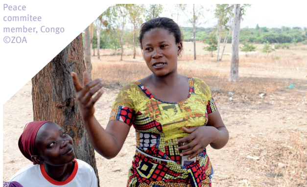
Peace committee member, Congo