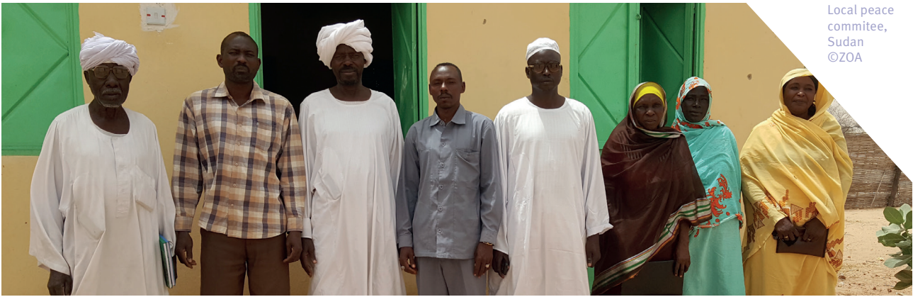
Local peace committee, Sudan

A number of tips and opportunities were shared during the learning event in order to address these barriers: